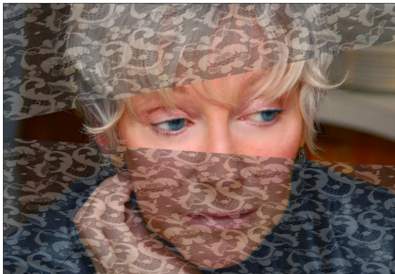
Advanced Gold "Through the Veil"