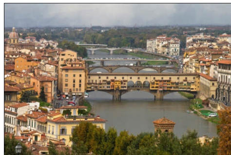
© Dario Di Sante (all images in this article)