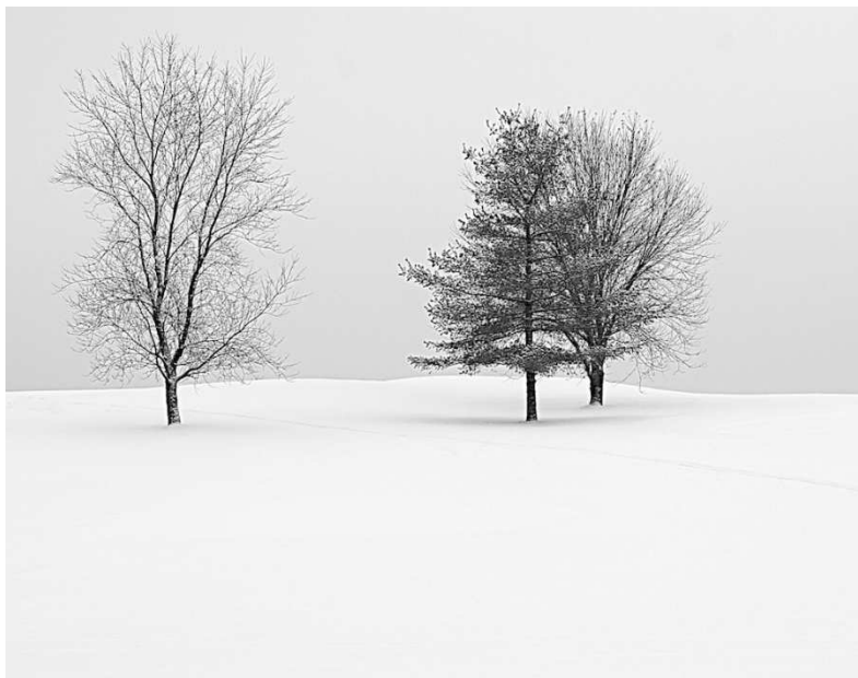
Intermediate Gold "Snowscape"